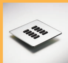
Mirrored Stainless Steel