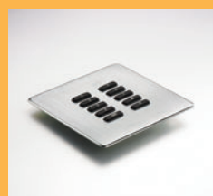
Brushed Stainless Steel