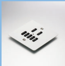
White Plastic or White Metal