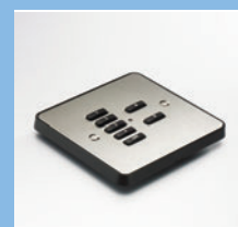
Brushed Stainless Steel shown with surface mount black pattress