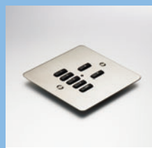
Brushed Stainless Steel