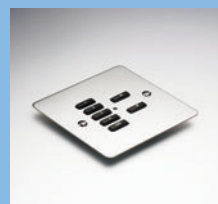
Mirrored Stainless Steel