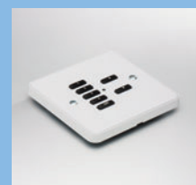
White Plastic or White Metal shown with surface mount pattress