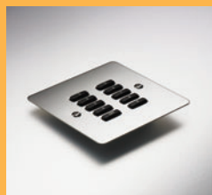
Mirrored Stainless Steel