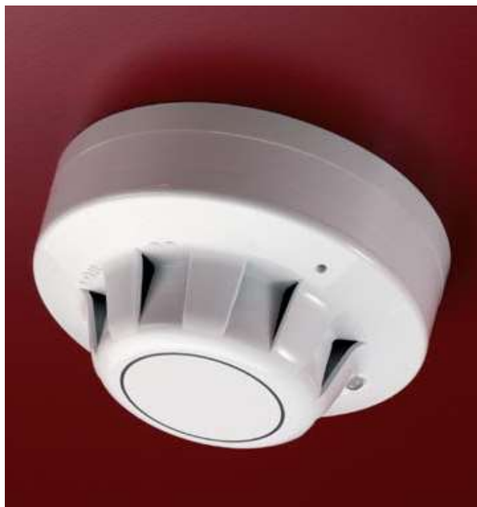
Optical Smoke Detector